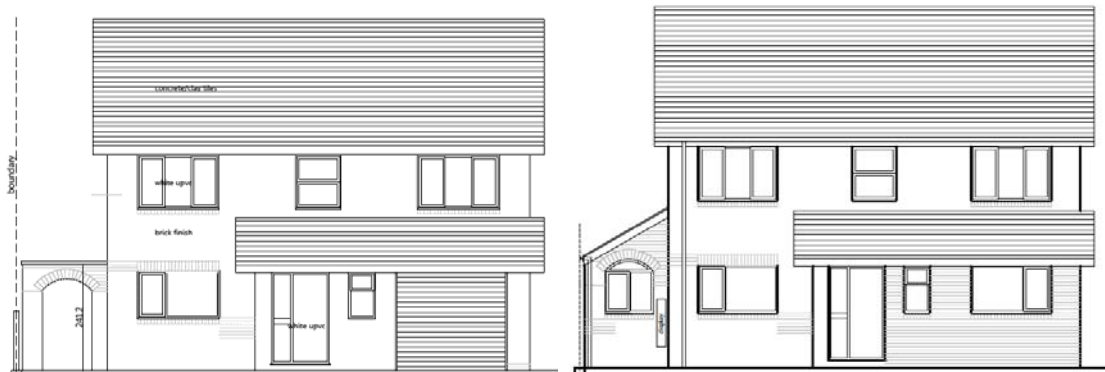
Existing and Proposed front elevations

garage door which would be replaced with a window. It is considered the proposed development would be acceptable in terms of its impact on the host house. It would be in keeping with the scale and character of surrounding buildings and their associated settings, and respect the character and visual amenities of the area.